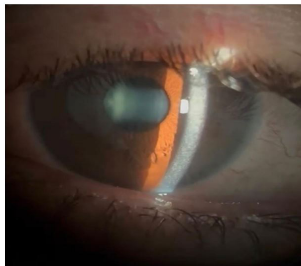
Figure 2 : Optical section demonstrating crystals in the corneal stroma